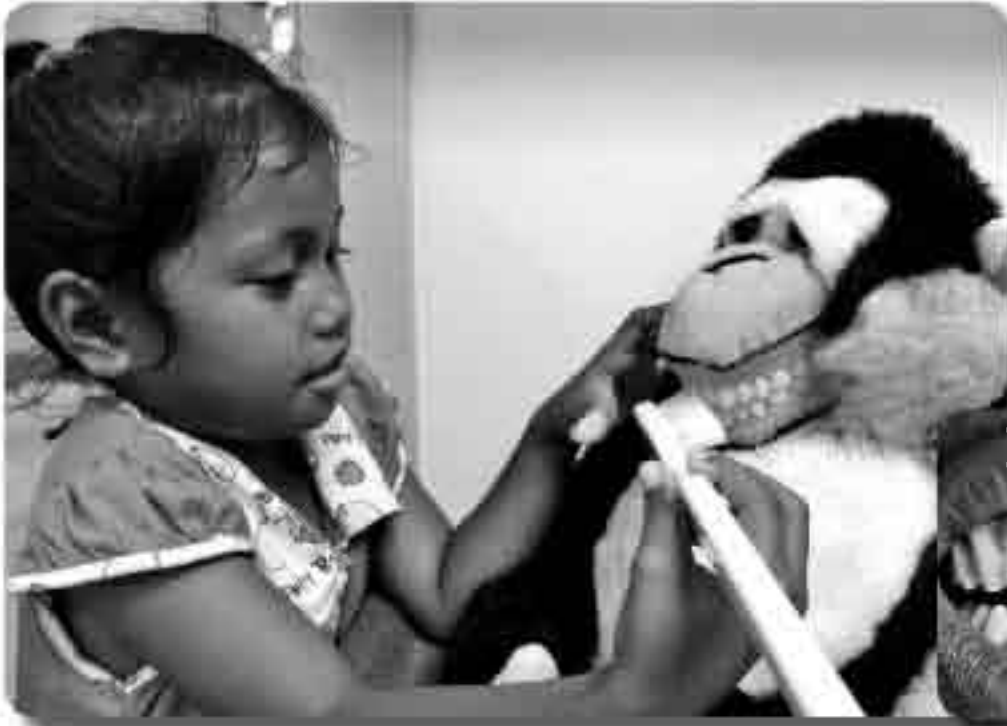
A young girl practices brushing teeth during a Canvasback clinic on Ebeye last month, while the photos below show the before and after work of the dental clinic.

Earlier this year, the group's ophthalmology, orthopedic, cardiology, and dental teams provided $1.2 million worth of medical services at Ebeye. Canvasback has been providing services in the Marshall Islands since 1986 and helps operate the Kumit Wellness Center in Majuro.